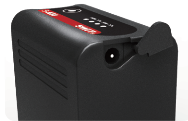
7.2V DC power output