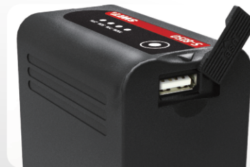
5V/1A USB power output