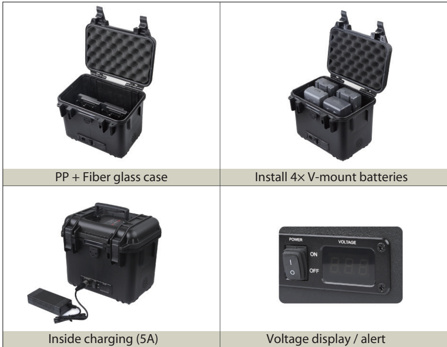
PP + Fiber glass case