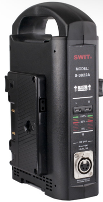
S-3822A for Gold Mount