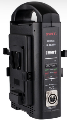
S-3822S for V-Mount