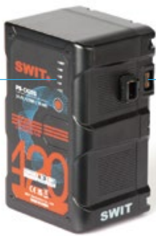
5-level Power indicator

Consists of 24pcs Li-ion cells, 14.4V nominal voltage, 420Wh, 29.4Ah large capacity, and provides 2x D-tap sockets for camera top devices.