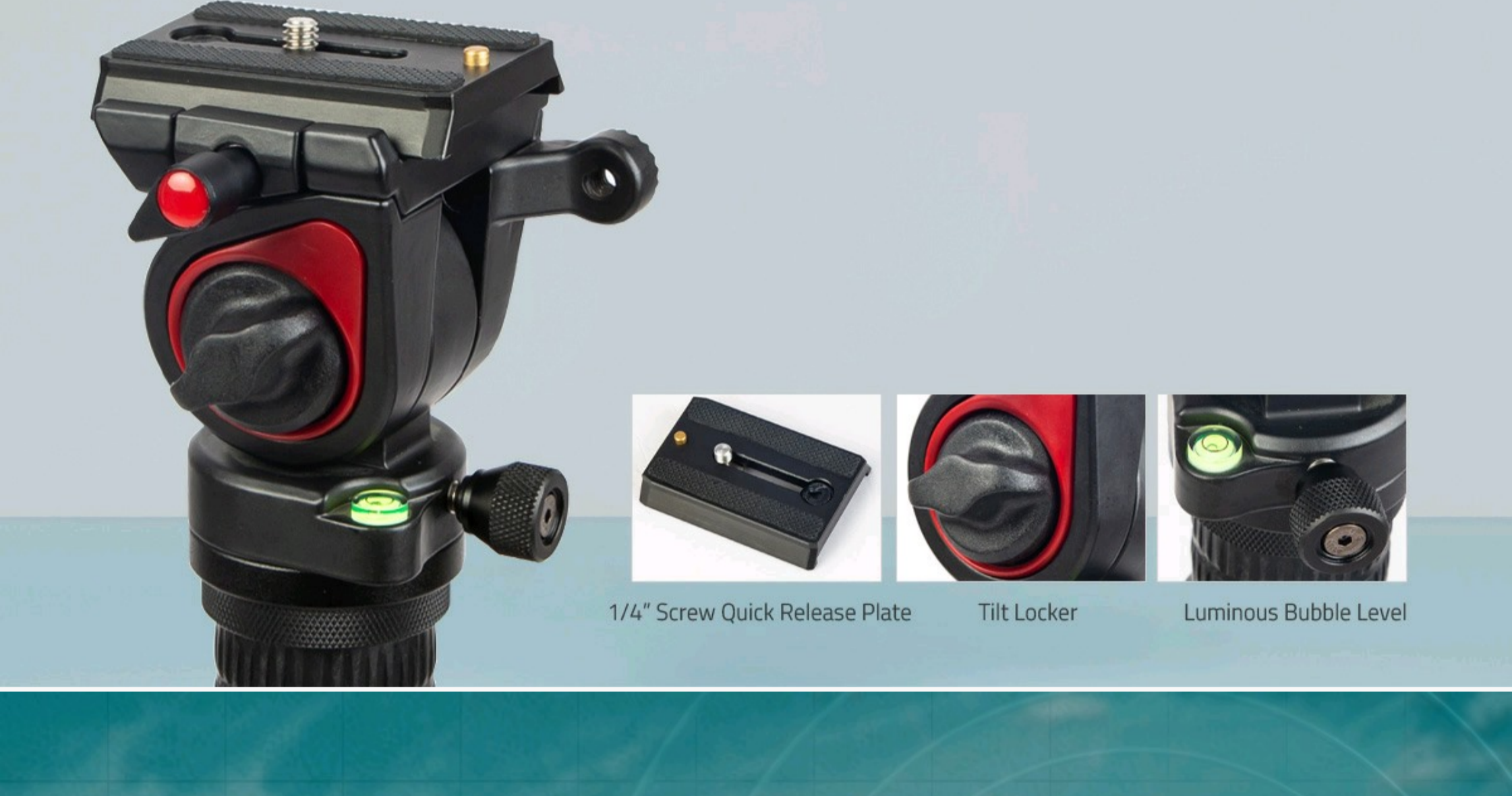
1/4" Screw Quick Release Plate Tilt Locker Luminous Bubble Level