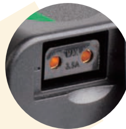
14.4V D-tap output