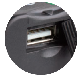
5V/2A USB output