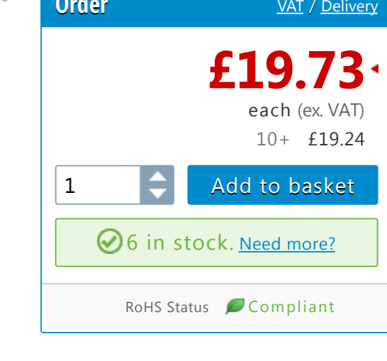
Image may be provided for illustrative purposes only, please refer to the product description.