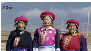
Face Detection AF

This feature is important especially in more demanding 4K shooting applications, such as recording interviews or lectures, helping a specific person subjects automatically stay in pin-sharp focus.