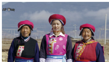
Face Detection AF

This feature is important especially in more demanding 4K shooting applications, such as recording interviews or lectures, helping a specific person subjects automatically stay in pin-sharp focus.