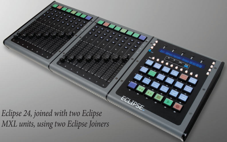
Eclipse 24, joined with two Eclipse MXL units, using two Eclipse Joiners