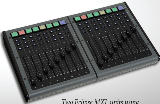
Two Eclipse MXL units using one Eclipse Joiner