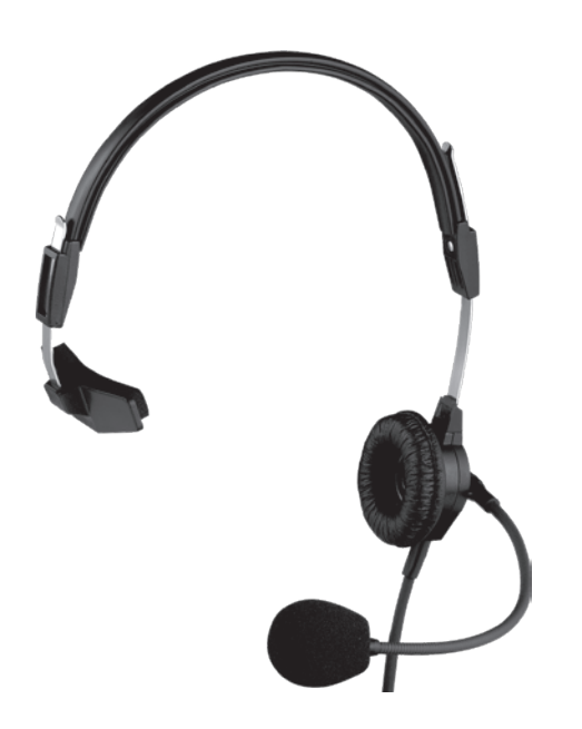
PH-88 Single-Sided Headset with Flexible Dynamic Boom Mic

The PH-88 is a single-sided super lightweight headset for the ultimate in daylong comfort. It offers a dynamic noise-canceling gooseneck microphone with a semi-rigid, fully adjustable boom for precise positioning. The high-quality wide band dynamic earphones are covered in moleskin for superior fit, isolation and frequency response. Available with 4-pin male or female XLR connectors with coiled or straight cords, a 5-pin male XLR connector, dual 3.5mm connector, or a 3.5mm 4-conductor connector.