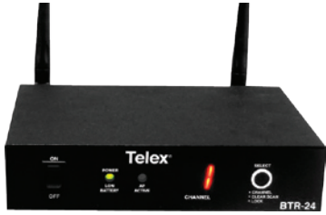
BTR-24 Base Station