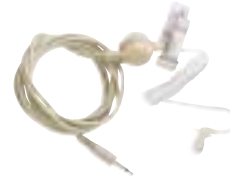
CES-2 includes: RTV-04, CMT-98, ET-4