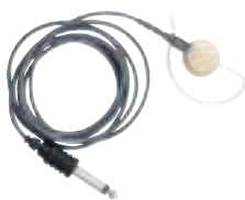
EMV-2 includes: RTV-04, CMT-2, AEF-3