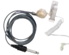
CES-1 includes: RTV-04, CMT-2, ET-4