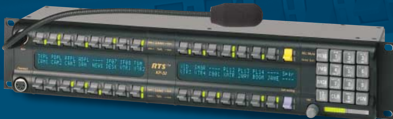
1 Shown with optional MCP-90 microphone

The RTS KP32 FAMILY of user stations offers an unbeatable match of features, options, and performance.