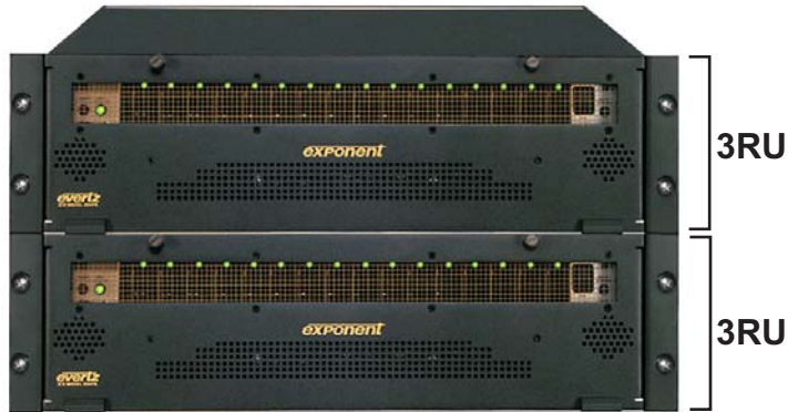
Evertz exponent DA Frame

Total Number of Output BNC's per 6RU = 288