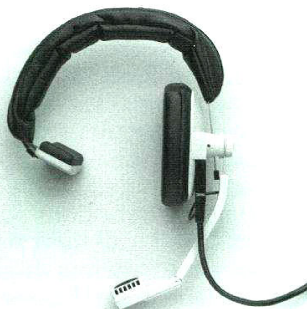
Beyer DT108 Single phone w/ 6 ft. cord and A4M connector