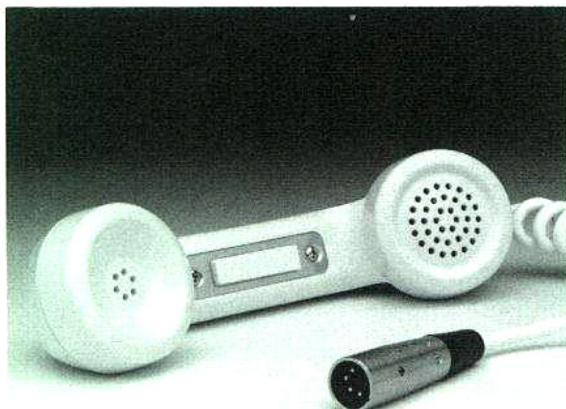
Handset Model HS6000 Dynamic microphone and push-to-talk switch