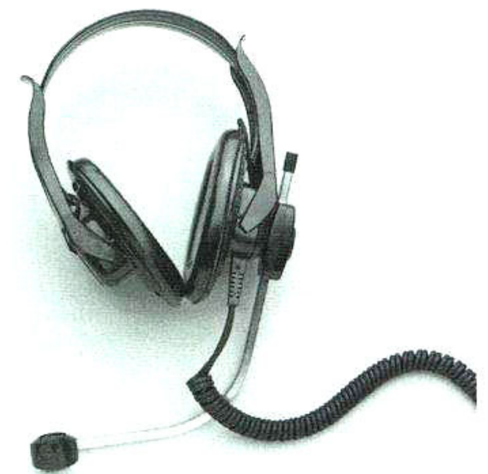
Setcom 51303XD Dual phone w/ 6 ft. coil cord and A4M connector