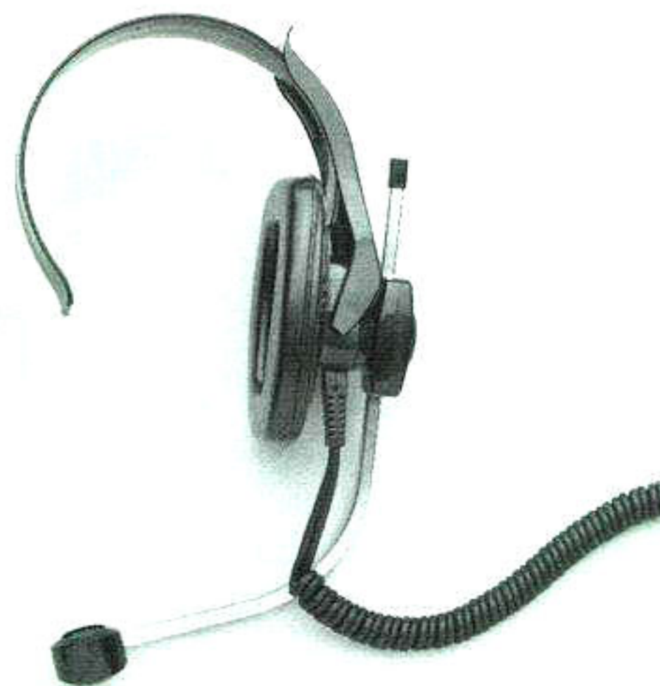
Setcom 51103XD Single phone w/ 6 ft. coil cord and A4M connector

All headsets and handsets are prewired with the appropriate mating connector and are fully tested. The Beyer headsets sold by RTS Systems are equipped with 50 ohm receivers, 150 ohm microphones. Setcom headsets are standard equipped with 300 ohm receivers, 150 ohm microphones.