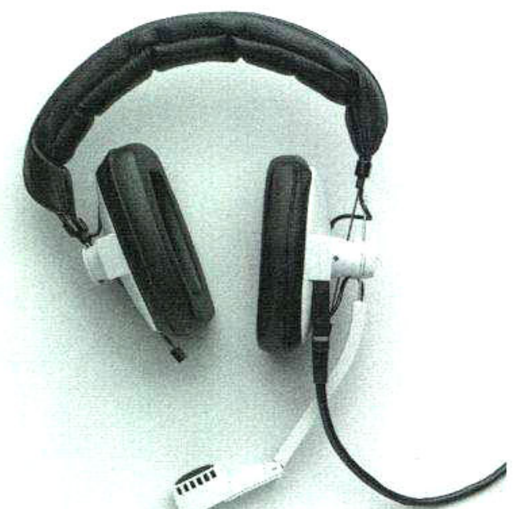
Beyer DT109 Dual phone w/ 6 ft. cord and A4M connector DT109/A5M Dual phone w/ 6 ft. cord and 5-pin connector